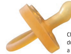
Cherry-shaped dummy with a thick teat