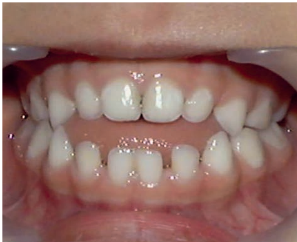
Open bite with incorrect position of the tongue, caused by intensive use of a dummy

If the dummy stays in the child's mouth for long periods, it can be a contributing factor to misalignment of the jaw or teeth. A typical misalignment of the jaw and teeth is an open bite where the front teeth do not meet.