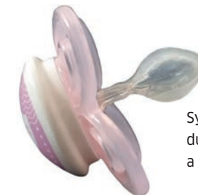
Symmetrical dummy with a thin teat