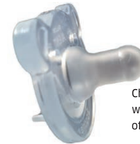
Cherry-shaped dummy with a thick teat, made of a sturdy material