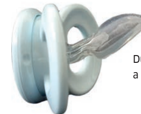
Dummy with a thin, angled teat